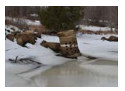
Fire suppression intake tower